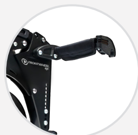
Quick release handles to activate and release