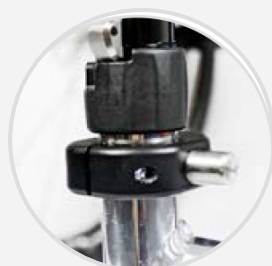
Retro fit to any TIGA/TIGA fx via mounting clamps